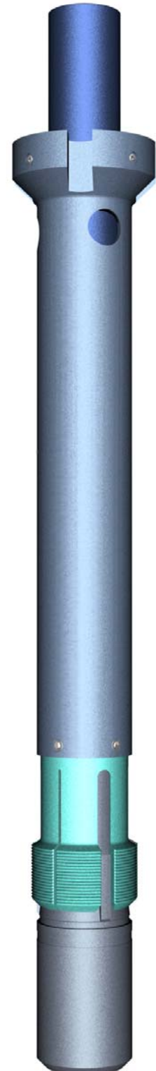
STT dressed for 9 5/8" Casing